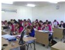
Free Tuition to IDF Soldiers